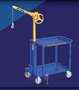
Mobile Cart Sky Hooks