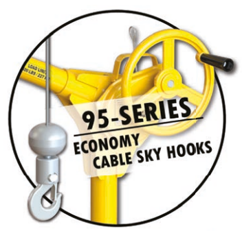
Lever Operated Friction Brake 3/16" Wire Rope

Economy Sky Hooks have a simple and easy to use friction brake as well as some additional features making them ideal for applications requiring lower cost solutions. As with all of our Sky Hooks, they are designed and built to meet ASME and OSHA standards.