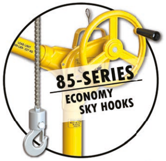
Lever Operated Friction Brake Roller Chain